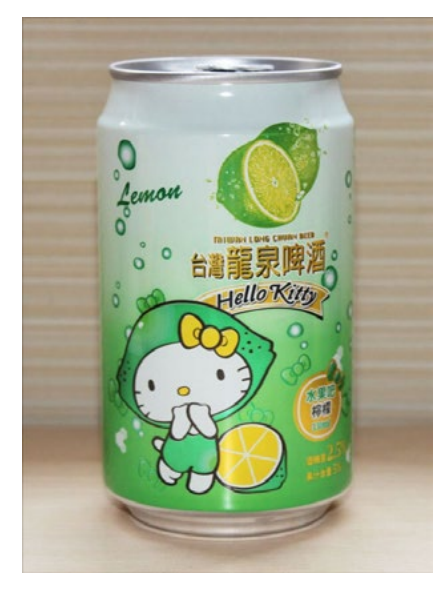
Marketing beer to women in Taiwan.

Voluntary codes, guidelines and responsible use campaigns are insufficient and not a substitute for legally enforceable measures.