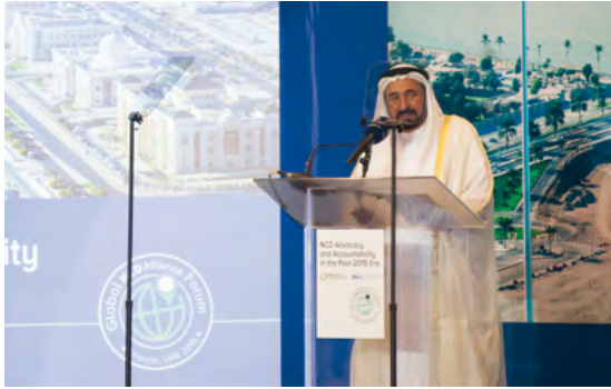
His Highness Sheikh Dr. Sultan bin Muhammad Al Qasimi, Member of the Supreme Council and Ruler of Sharjah was present at the Opening Ceremony of the Forum.