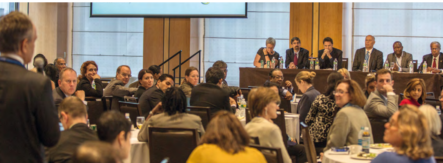
On 26 September 2015, we held a side event against the backdrop of the UN Sustainable Development Summit, entitled Translating the Post-2015 Agenda: Action on NCDs for a Sustainable Future . With a packed room and a very lively dialogue, the event focused on interlinkages between NCDs and broader sustainable development priorities.