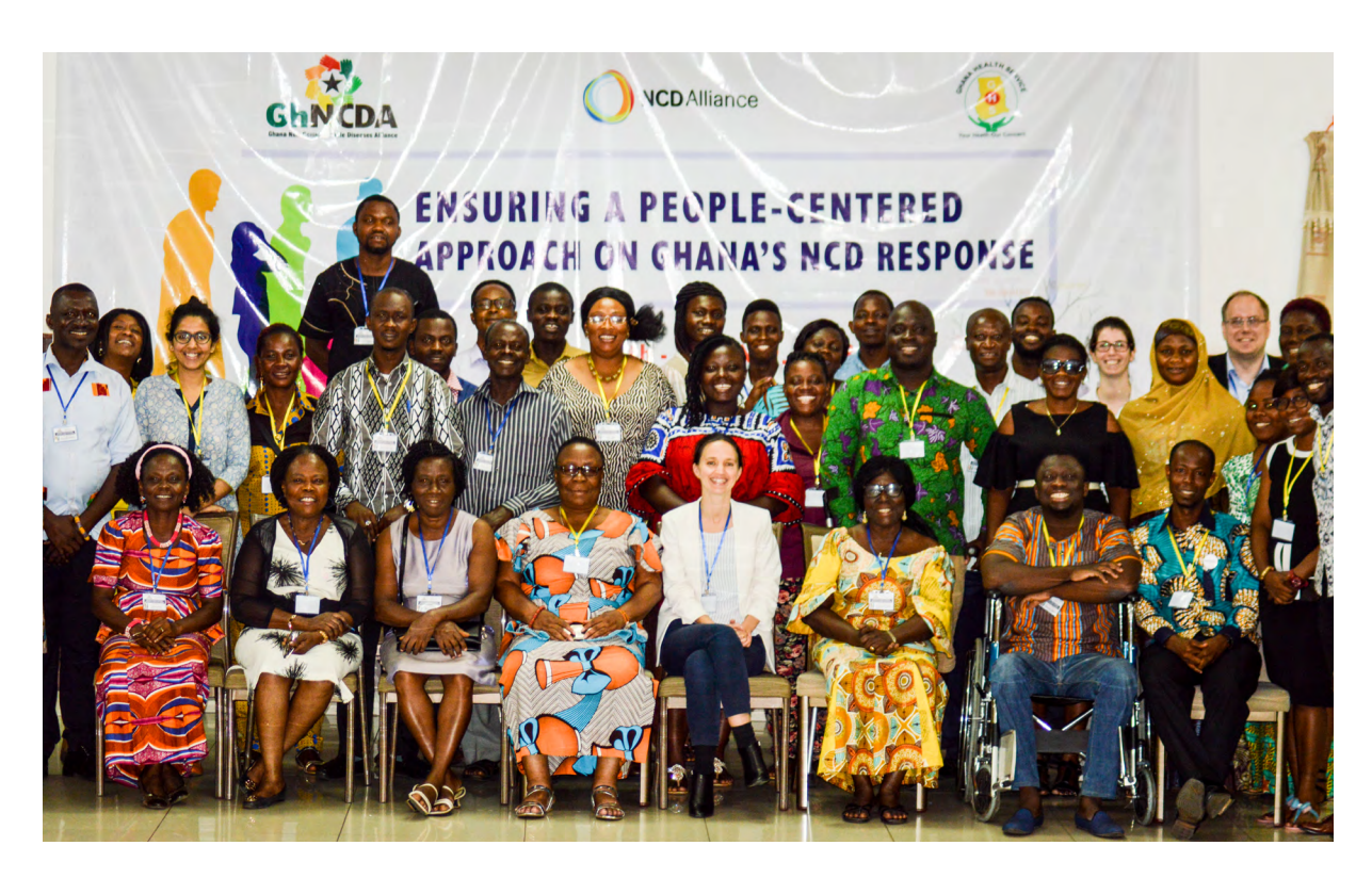
Participants at the "Ensuring a People-Centred Approach to Ghana's NCD Response" workshop in Ghana.