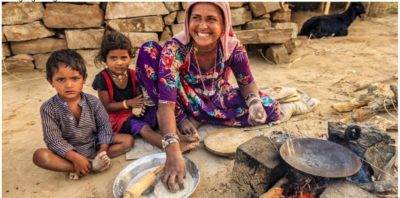
Manifesto on the Double Burden of Malnutrition, cover photo

More than one in three low- and middle-income countries face both extremes of malnutrition, according to a new The Lancet Series on nutrition launched on 16 December 2019.